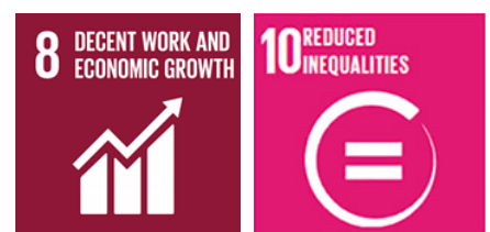
Contributing to Sustainable Development Goals:

■ Civil sector ■ Public sector ■ Private sector