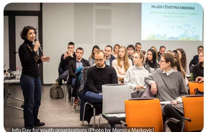
Info Day for youth organizations

The Project team initiated partnership with the private sector SBB Foundation on initiatives with positive impact on environment and the society. Following one of the UNDP's Youth Green Startup training, several participants applied with their green ideas for the SBB Foundation award program, and one of them was selected and received funds, making her idea a reality.