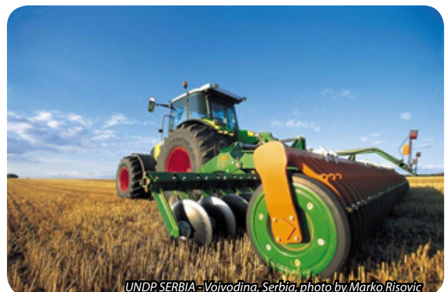
UNDP SERBIA - Vojvodina, Serbia