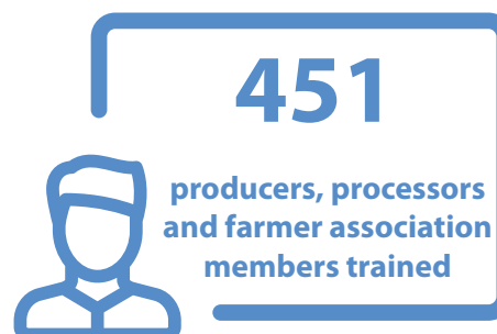
Participants of trainings for increasing agribusiness export (by gender)